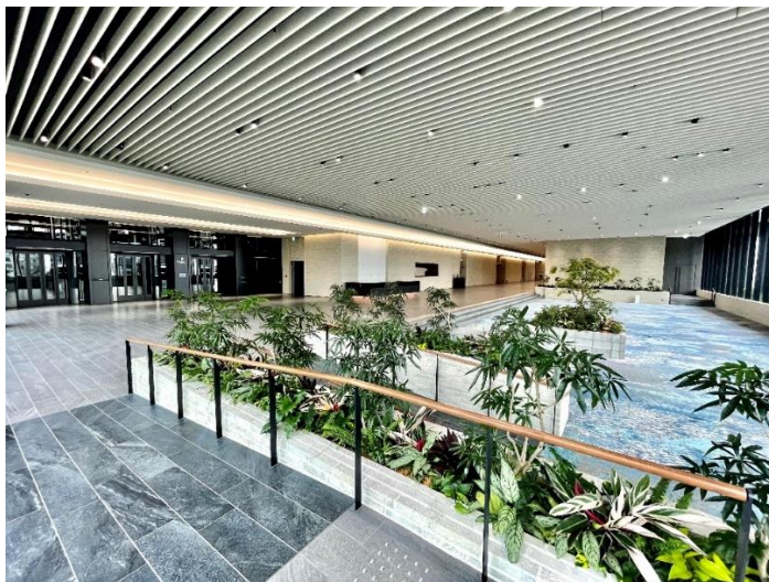
“Sky Lobby” on the 11 th floor

The redevelopment project was pursued with focus on sustainability and environment-friendliness. The site features 3,000m 2 of green space and Hibiya Fort Tower also features the latest environment-friendly specifications such as eaves that extend out 2.8 meters to block direct sunlight and motorized window blinds that automatically tilt in response to the position of the sun in the sky. Reverse vending machines will also be installed at the site as part of an initiative to achieve SDGs (Sustainable Development Goals). Points will be used to reward those who use the machines, and these points can be used to purchase wellness-related products and services aimed at helping to enhance people’s physical and mental health and the health of wider society.