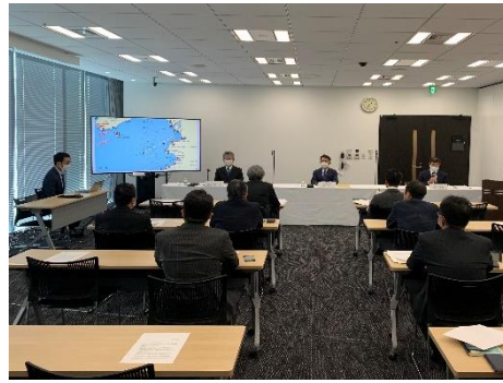
Mock press conference

Contact : Stakeholder Relations Department / (TEL) +81-3-6273-3069